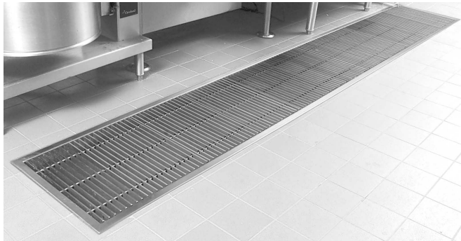
anti-splash floor trough

Eagle Anti-Splash Floor Trough with stainless steel grating, model _____. Unit constructed of 14/304 stainless steel all-welded construction. Patented anti-splash design (patent #D519,618 S) assures complete drainage while preventing splash back onto the floor. Drain accommodates up to a 4"-diameter pipe and comes standard with a stainless steel removable perforated basket. Type 304 stainless steel subway style grating shall be 3/16" x 1" vertically positioned bars spaced 1" apart for ease of drainage. Two 5/8" stainless steel rods, set 2 1/4" in from each edge, are welded to the bars to eliminate swaying.