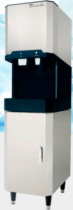
BLDN-280A on BLDS-16-32 (Sold separately)