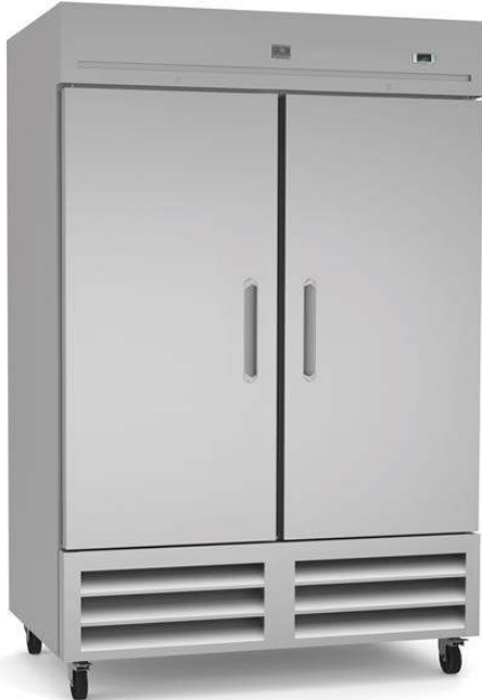
738242 (KCHRI54R2DRE) 2-Door Full Height Refrigerator 54" Long