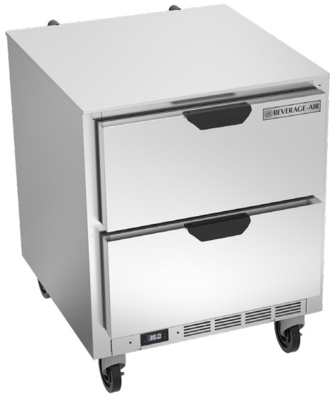
*Note: Shown with optional full electronic control

7 Year Parts/Labor Warranty 7 Year Compressor Warranty