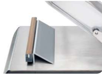
Standard support for vacuum bags with liquids