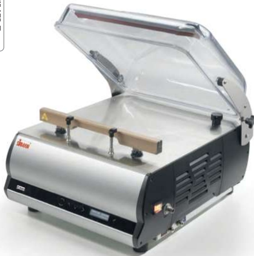
W8 TOP 40 DX with inert gas and AOR optionals