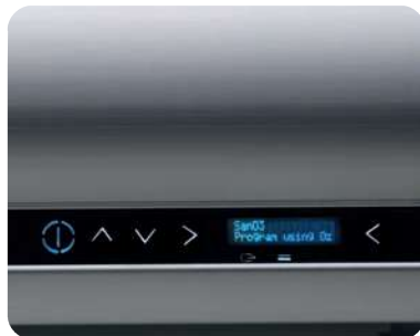
W8 Top Touch control