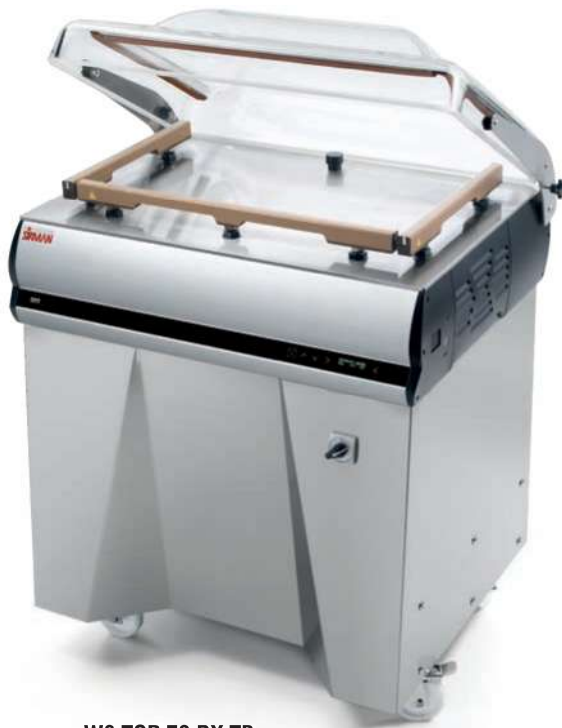
W8 TOP 70 DX TB