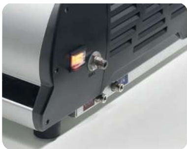
W8 Top 40-50 DX G Option inert gas and A.O.R.