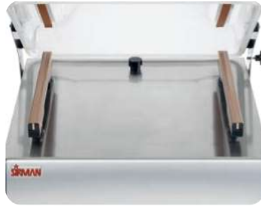
W8 50 DX DB 1 left and 1 right seal bars design