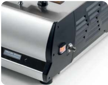
W8 Top 50 DX G with inert gas flush ready