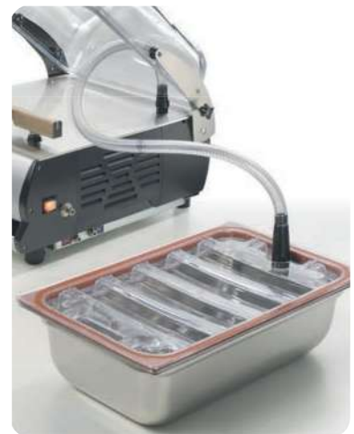
External vacuum: hose + GN container + lid Reinforced Gastronorm Containers and Lids