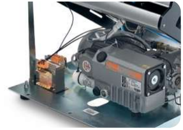
Easy access for oil change and service