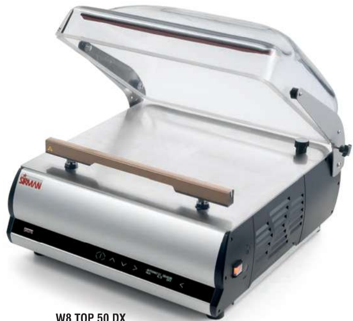
W8 TOP 50 DX