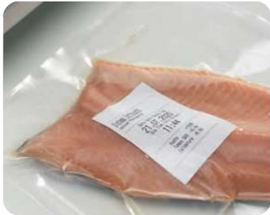
Optional adhesive paper for built-in printer