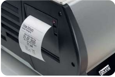
Thermal label printer - option