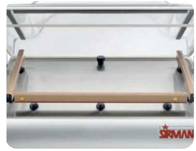
W8 70 DX TB 3 seal bars design