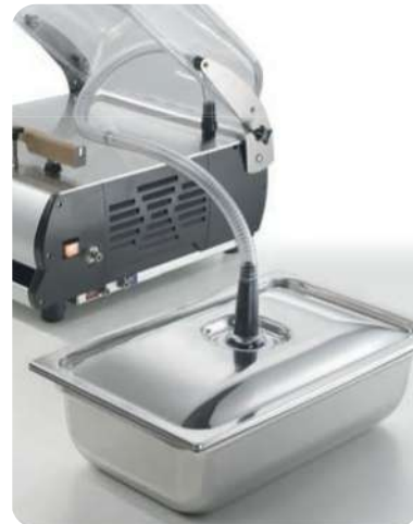
External vacuum: hose + GN container + lid Reinforced Gastronorm Containers and s/steel Lids