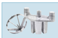
FWS-6BK Replacement wedger and blade for citrus fruits