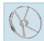
FWS-6BC Apple corer blade