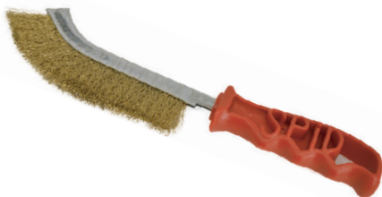
Panini Grill Cleaning Brush