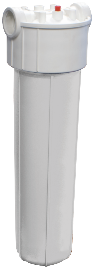
CC-420 Chloramine Carbon System

Increase the quality of your water with the CC-420 Chloramine Carbon System from VIZION™. Designed for use by itself or after a VZN ultrafiltration system, the CC-420 reduces chloramines and removes objectionable tastes and odors.