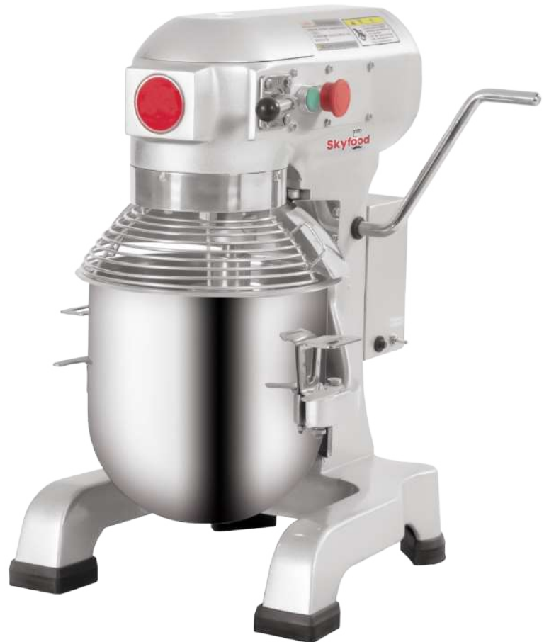
SMM10 10 qt Planetary Mixer

Conforms to the following Standards: ETL electrical and sanitation (under UL, CSA and NSF Standards).