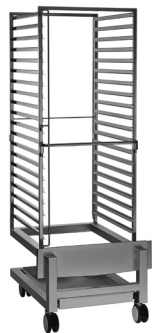
5026385 Fits 20-20E, 20-20G, 20-20MW, and QC3-100