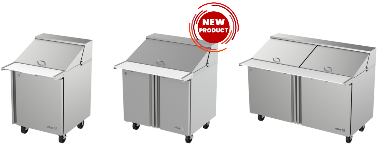
APMT-27-12 HC NEO