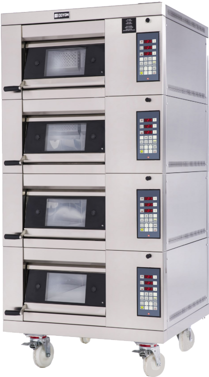
*SHOWN IN 1T4