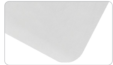
14-Gauge 3003 Aluminum Blade