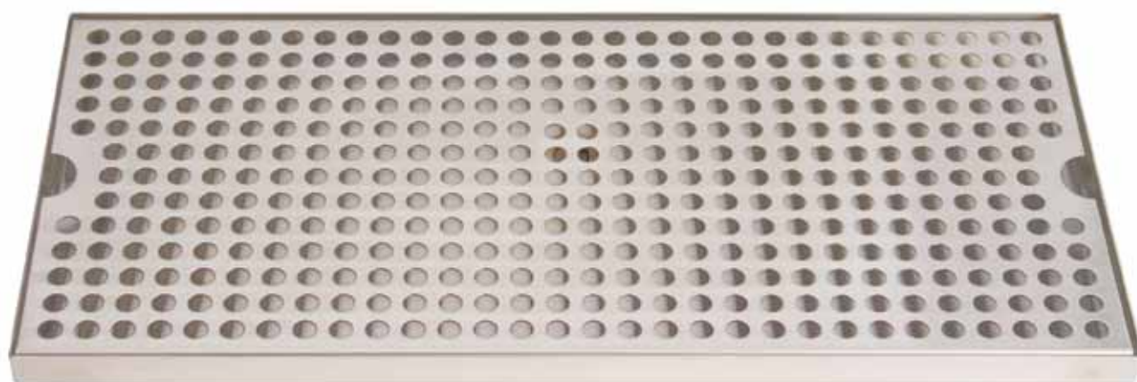
Stainless Steel DP-820D-18