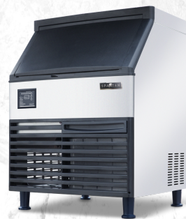
SUIM-160 SUIM-210 SUIM-280