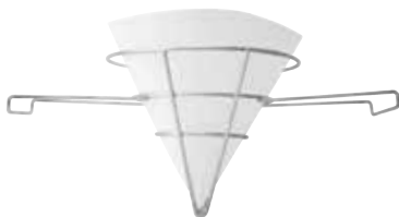
FF-10 & FF-RC