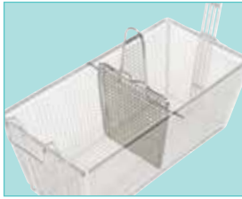
Divide fry baskets for smaller batches Shown with FB-25