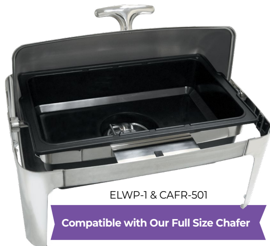
ELWP-1 & CAFR-501