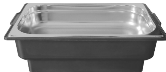
ELWP-1 with 1/1 Size GN Pan *GN pan sold separately