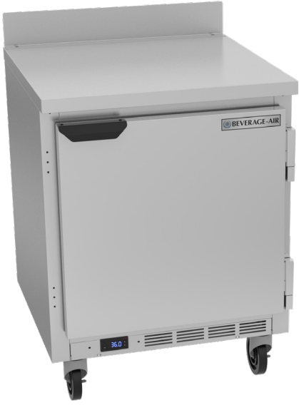
*Note: Shown with optional full electronic control