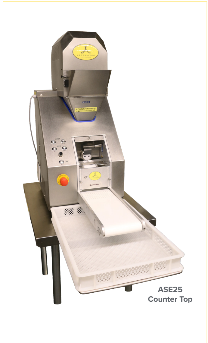
ASE25 Counter Top