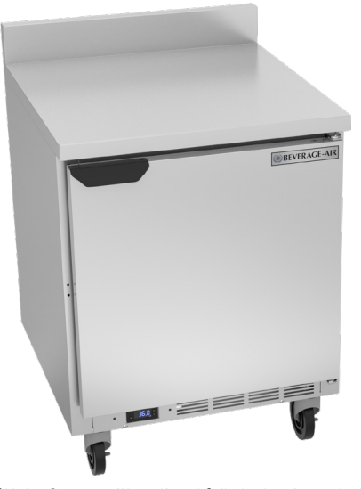
*Note: Shown with optional full electronic control

7 Year Parts/Labor Warranty 7 Year Compressor Warranty