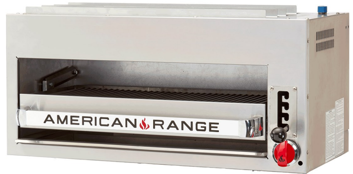
Model Shown ARSM-36