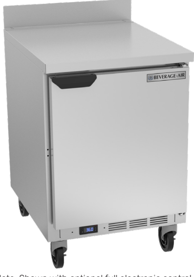
*Note: Shown with optional full electronic control

7 Year Parts/Labor Warranty 7 Year Compressor Warranty