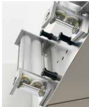
Metal gears transmission

Certified to UL 763 and NSF 08 Certified to CSA Standard C22.2