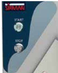
IP 67 stainless steel controls