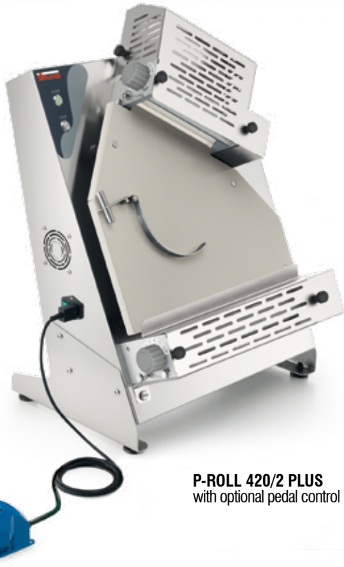
P-ROLL 420/2 PLUS with optional pedal control