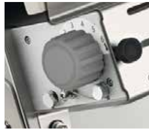
Adjustable thickness by plastic knobs