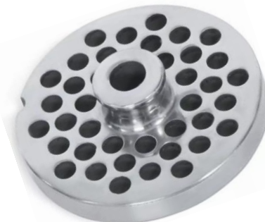
2 Plates Included (6mm & 8mm) Additional Accessories Available Upon Request

** Due to continuous product improvement, specifications are subject to change without notice.