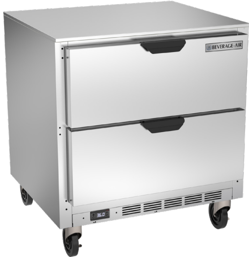
*Note: Shown with optional full electronic control

7 Year Parts/Labor Warranty 7 Year Compressor Warranty