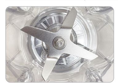
Industrial Grade Stainless Steel Blade