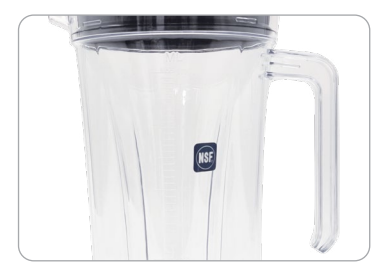
BPA-Free Food Grade Jug