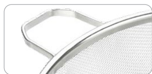
Helper Handle of SSTR-10 Series