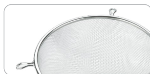
Convenient Hooks of SSTR-06/08/11 Series