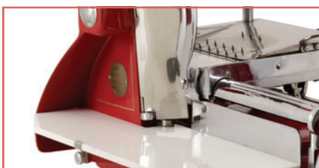
Removable stainless steel slice receiving tray for total hygiene