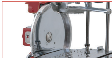
360° blade guard for safety