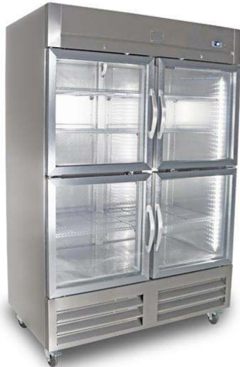
738316 (KCHRI54R4HGDR) 4-Half Glass Door Full Height Refrigerator 54" Long