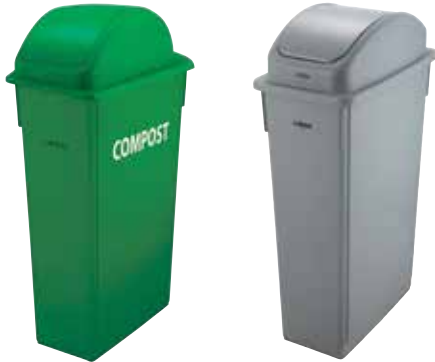
PTC-23GRC & PTCL-23GR