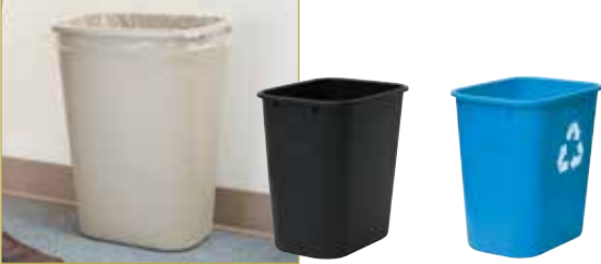
PWR-41BE Liner not included