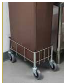
Fits most standard slim trash cans