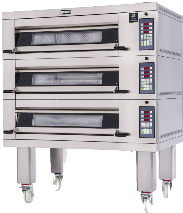
*SHOWN IN 2T3