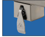
Knee Valves Included On All "KV" Models