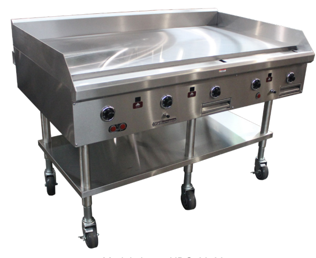
Model shown HDG-60-30 shown with optional stand and casters

HEAVY DUTY, 30" DEEP GRIDDLE, THERMOSTATIC, GAS