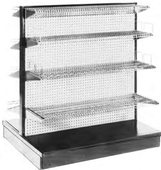
gondola with wire display shelving

Eagle Wire Display Shelving, model _____. Consists of shelf and pair of brackets. For use on all major shelving fixtures. Brackets are tier-notched to hold shelf in place. Shelves are zinc plated.