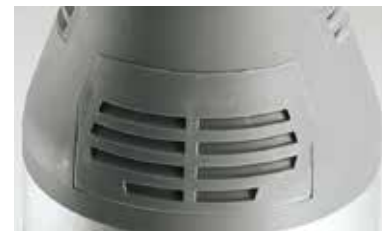
Exclusive ventilation system. Machine works longer!