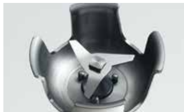
Stainless steel bell. Longer life!

Construction: Aluminum alloy covered by ABS plastic and stainless steel. Blades: Stainless steel.