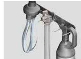
Wall support option