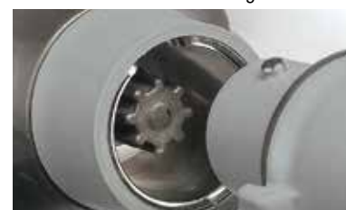
Feed tube "bayonet" slot. Changing shaft is quick & easy.