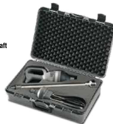
Carrying case option