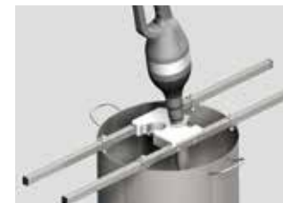
Bowl support option