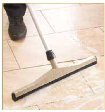
Adapts to variety of surfaces