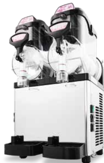
SSM-52 2.0 gallon x 2 Bowl