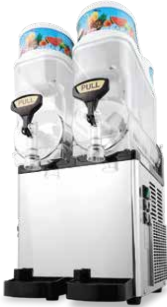
SSM-280 3.2 gallon x 2 Bowls