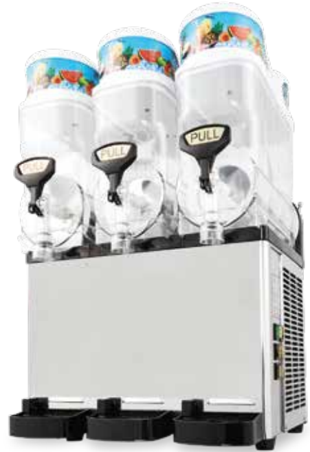
SSM-420 3.2 gallon x 3 Bowls