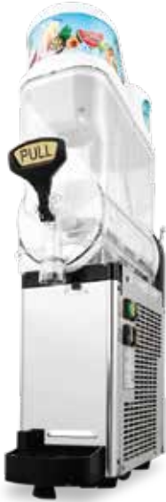
SSM-180 3.2 gallon x 1 Bowl