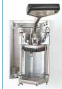
Wall mounted with HFC-BK