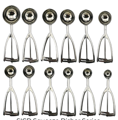
SICD Squeeze Disher Series