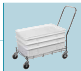
Transport dough boxes