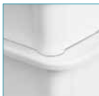
Seamless fit for fresh storage