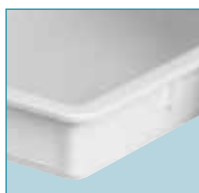
Reinforced edges & corners