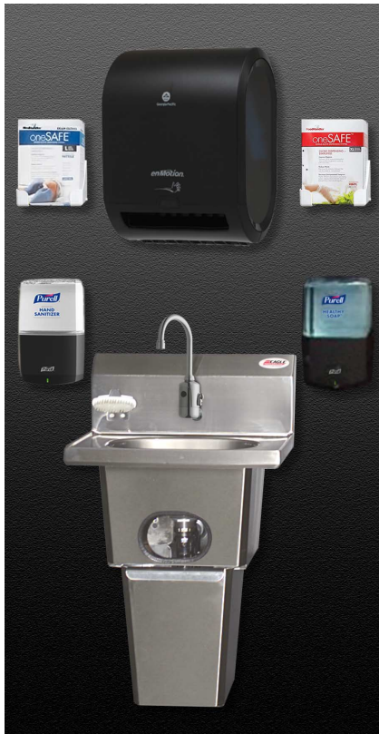
#HFL-5000 with towel dispenser, soap dispenser, hand sanitizer dispenser and glove box holders.

NOTE: Model HFL-5000 by EAGLE is listed under Kochman AutoCAD symbol library for foodservice equipment.