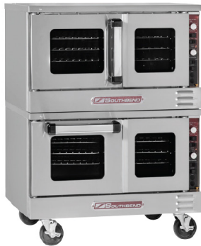
TVES/20SC shown with optional casters