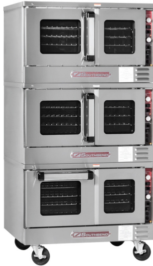
TVES/30SC shown with optional casters