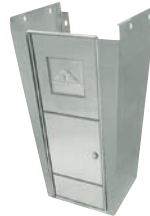
Add Trash Receptacle For 7-PS-33, 7-PS-37 or 7-PS-37B Only 7-PS-29

*Pedestal Base For 7-PS-20 and 7-PS-20-NF Hand Sinks 7-PS-37B