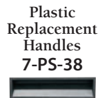
Plastic Replacement Handles 7-PS-38