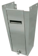
With Foot Valve 7-PS-33

For use with 10" x 14" Hand Sink Bowls* (Sinks Not Included)