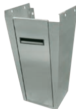
Basic Pedestal Base 7-PS-37