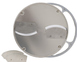
Slicing Disk w/ Spacers