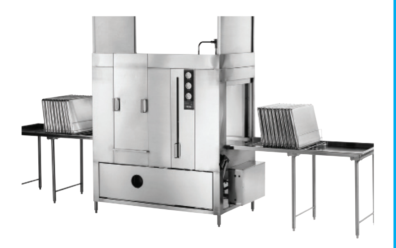
Rendered image is for general visual representation only. Please refer to specifications for the latest detailed product information.