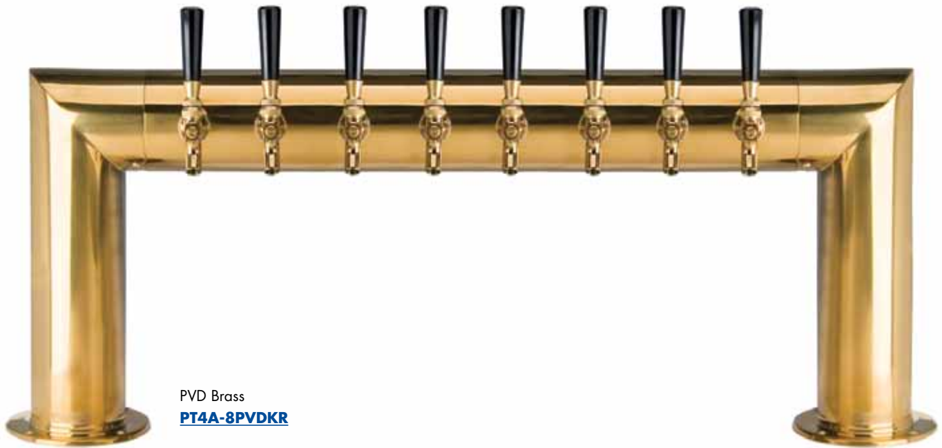
PVD Brass PT4A-8PVDKR