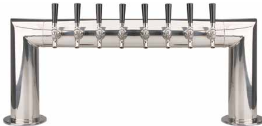
Stainless Steel PT4A-8PSSKR