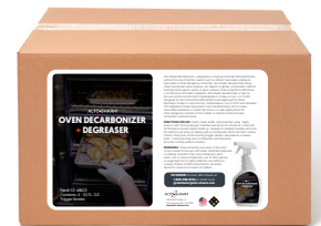
Oven Decarbonizer + Degreaser