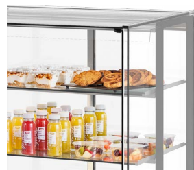
Maximum food visibility