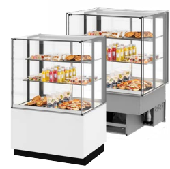
Models on underframe or drop-in version