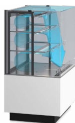
Patented Cold Booster technology