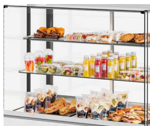
Three presentation levels