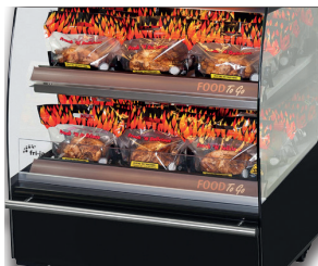
MD 86-2 self serve heated merchandiser

* see separate spec sheets for more information on the 4- and 5-spit rotisseries