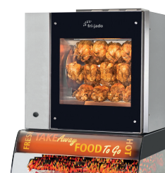
Space Saver with TDR5 M