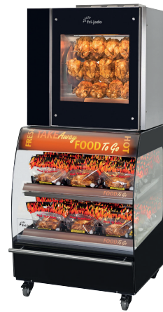
Space Saver with TDR5 P

The Fri-Jado Space Saver is a prime example of effective use of floor space. By combining a TDR 5 or TG4 rotisserie and a MDS 86-2 Self-Serve grab-and-go merchandiser, you save valuable floor space.