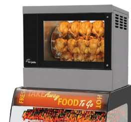
Space Saver with TG 4