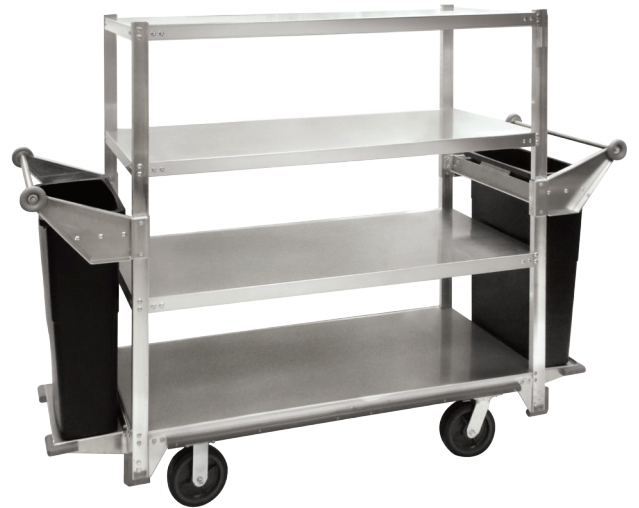
271-41-5927 (Shown with options and accessories, waste receptacles not included)